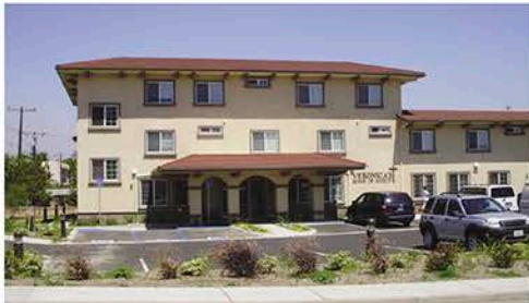
Veronica's Home of Mercy is funded in part by Arrowhead United Way