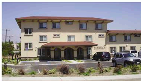
Veronica's Home of Mercy is funded in part by Arrowhead United Way